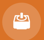
2ph step motor and 3ph step motor LG6040 pro