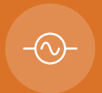
standard power supply