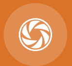
auto focus American lens