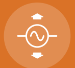
intelligent power supply