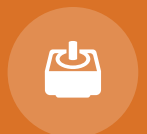
3ph step motor