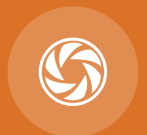
manual focus American lens