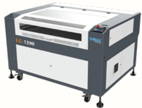
LC1390 X2 | LC1510 X2

LC6090 X2, LC1390 X2 AND LC1510 X2 are the favourite of garment producer, embroiderer and engraver alike. Thanks to the twin laser head which works synchronously, the X2 class machines produces twice as much as output at slightly higher investment to the LC class. We add long life laser tube, centralised lubrication for extra reliability and easy access to the laser tube compartment made maintenance work easier and faster. Additionally the machine is equipped with persistent memory system that save the machine's working state in case of blackout. When the power is restored, the machine can resume working seamlessly, therefore reducing discarded material. The X2 class machine has all the features and capabilities of LC class machine besides the auto focus and capable of cutting organic material such as acrylic, wood, particle board, leather, fabrics and many more non metal applications.